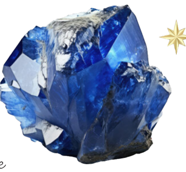
HAPPY BIRTHDAY TO THOSE BORN IN SEPTEMBER! YOUR BIRTHSTONE IS THE BEAUTIFUL BLUE SAPPHIRE

The fairies & unicorns, Wise Grandpa Tree and even the wild flowers have all become much quieter since Enchanted Nature Camp finished and as summer comes to a close.